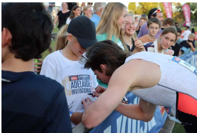
Tokyo Olympian Rohan Browning signing autographs at the Adelaide Invitational.