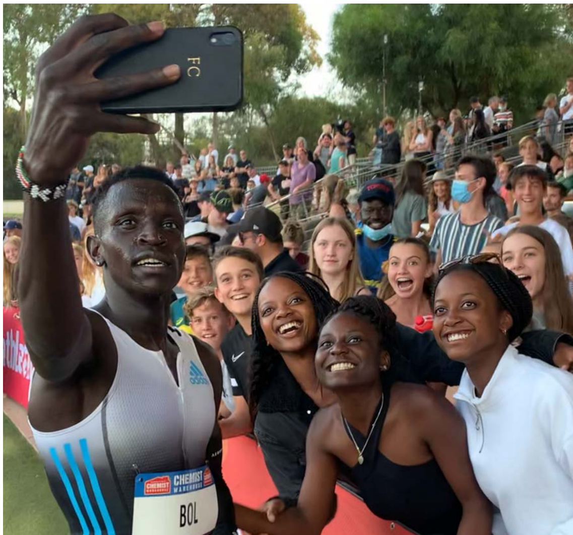
Tokyo Olympian Peter Bol engaging with fans following his 800m race at the Adelaide Invitational high performance meet, which was held in front of more than 2000 people at the SA Athletics Stadium in Mile End on February 12, 2022.