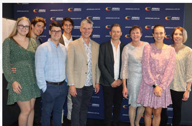
Athletics SA staff for the 2021-22 Season.