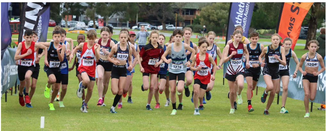
The U14 race at the 2022 State Cross Country Championships.