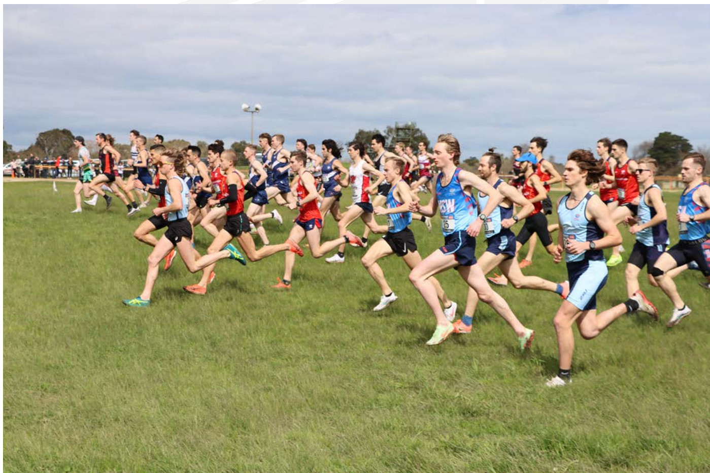
The Open Men's field at the 2022 Australian Cross Country Championships.